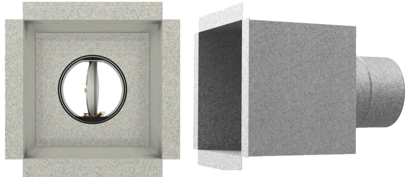
Optional Grille available

The CVP Plus is an enhanced Constant Volume Regulator that accurately controls the maximum volume of air supplied into and exhausted from a space. The CVP Plus has an innovative spring-loaded damper that reacts to the air velocity moving through. As velocity increases, the blade moves toward closed to restrict the free area and deliver only the desired volume of air. The CVP Plus is accurate to \pm 10\% of setpoint in systems with a pressure range of 0.2" – 2.0 InWC. Maximum volume is easily established by setting the adjustment arm to the desired air volume, calibrated in CFM, on the front of the regulator. See inset right.