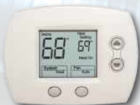
T-511 Digital Thermostat