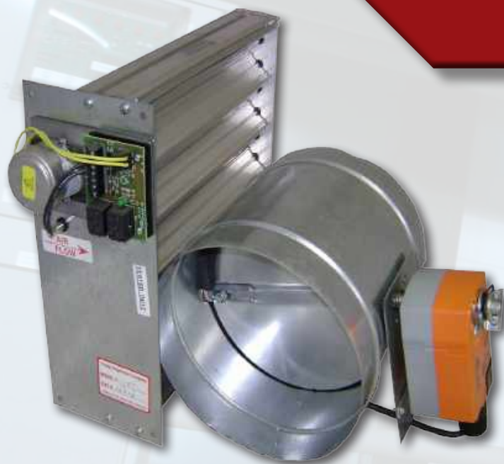
2010 Round / 2050 Rectangular Choose Synchronous or Brushless Motor