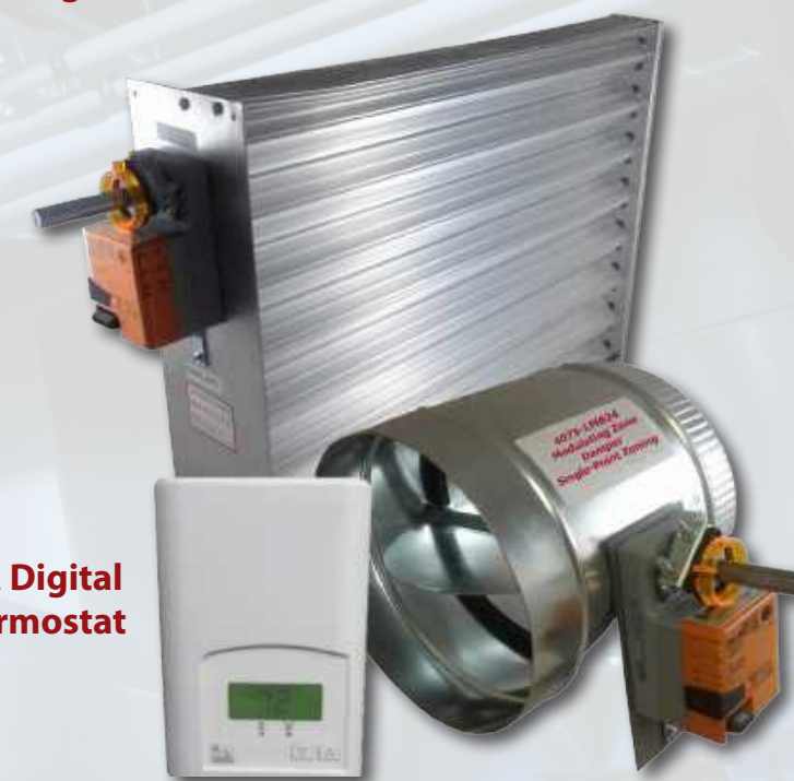
T-720A Digital P/I Thermostat