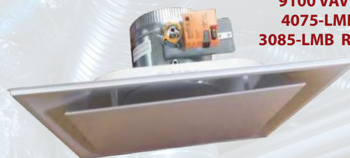
9100 VAV Diffuser 4075-LMB Round 3085-LMB Rectangular

use the T-720A, a digital display thermostat with duct sensor that employs a Proportional / Integral algorithm to precisely control room temperature. When the room is above set-point and duct temperature is below, the damper starts to open. It stops when the room temperature approaches set-point, virtually eliminating overshoots. The damper moves toward closed when the temperature goes below set point. (Heating works in the opposite direction)