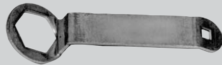
021 Socket Wrench